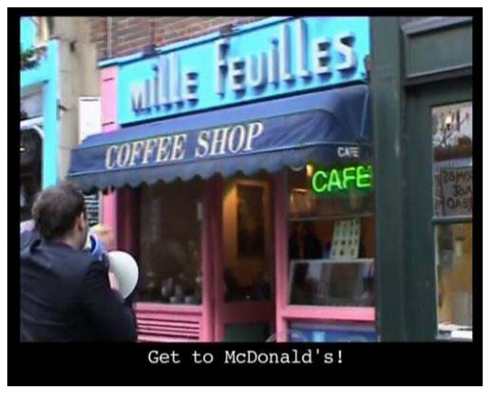
and its American cousin Billionaires for Bush: