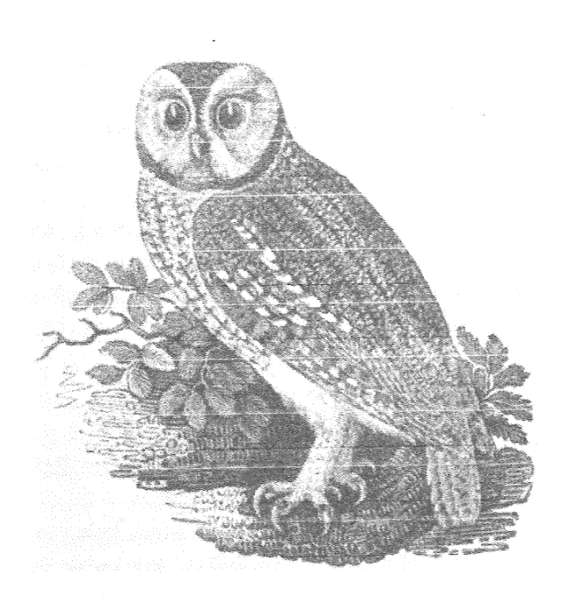
THE TAWNY OWL. COMMON BROWN IVY OWL, OR HOWLET. (Strin Stridula, Lin.—Le Chathuant, Buff.)