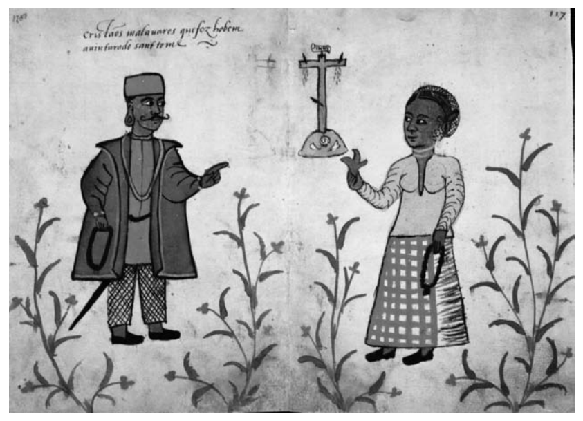
Illustration 3 – St. Thomas Christian couple, in Codex Casanatense, end of the 16<sup>th</sup> Century, Biblioteca Casanatense nr. 1889, Rome, Italy

There are such a quantity of them [The Mappila] and so closely related to the land that I have the impression that they form a fifth part of the population. These Moors called Mappila are present in all sea ports, cities and provinces. They are very rich and wealthy. The whole sea trade and navigation lies in their hands<sup>48</sup>.