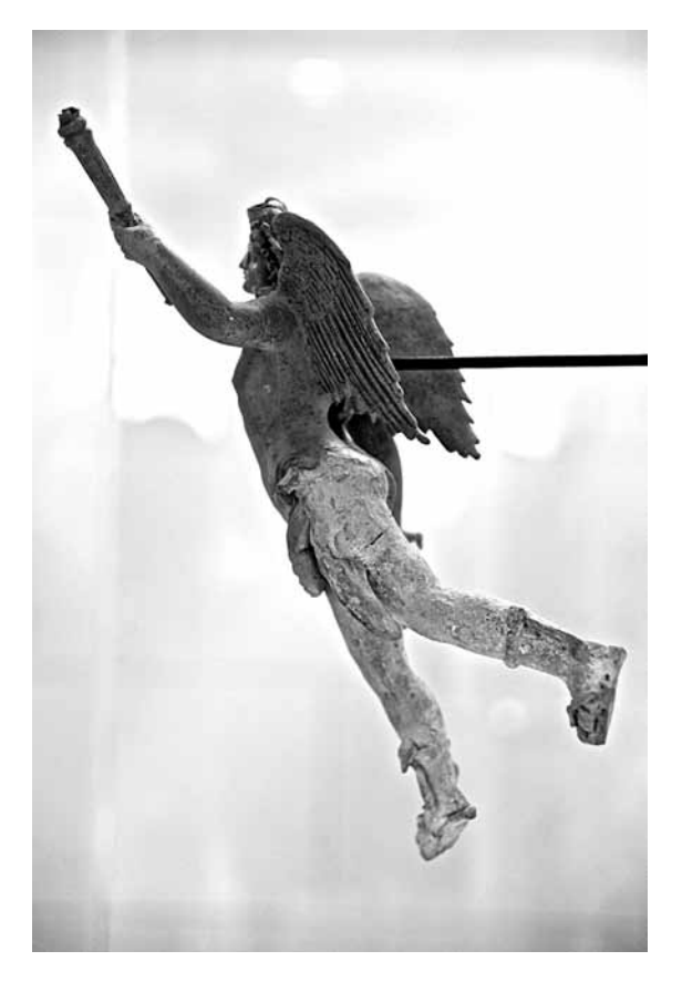
Fig. 4