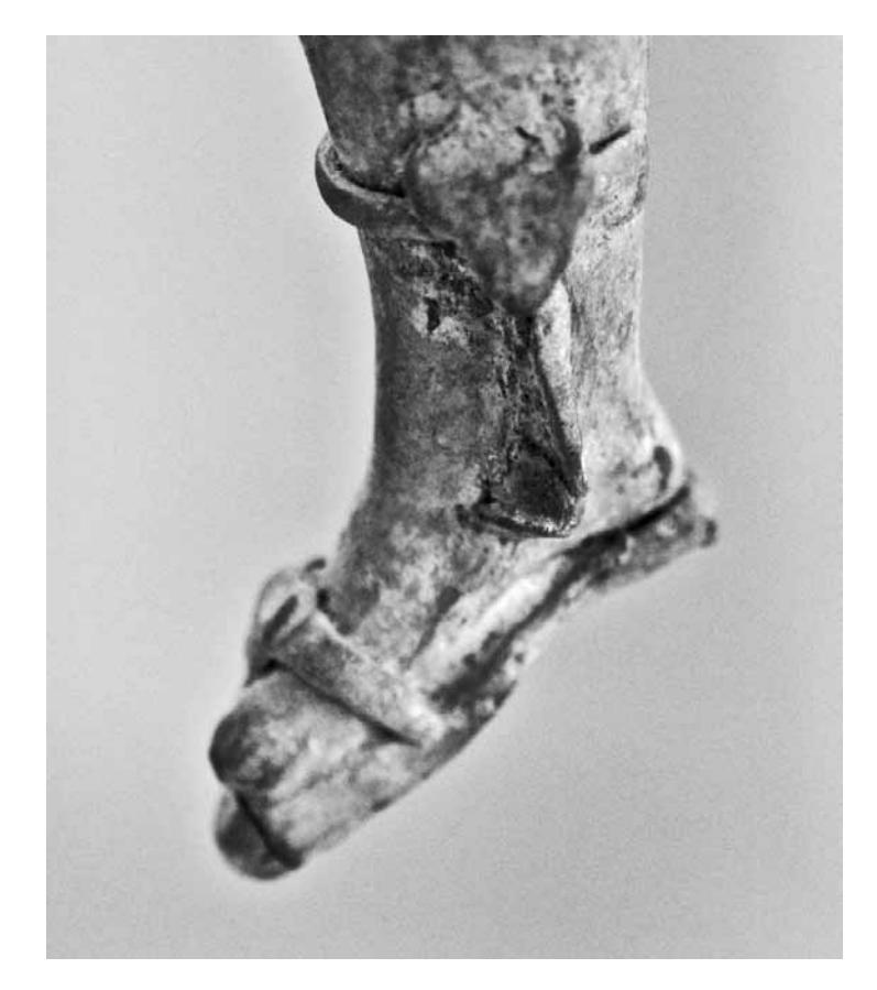
Fig. 5