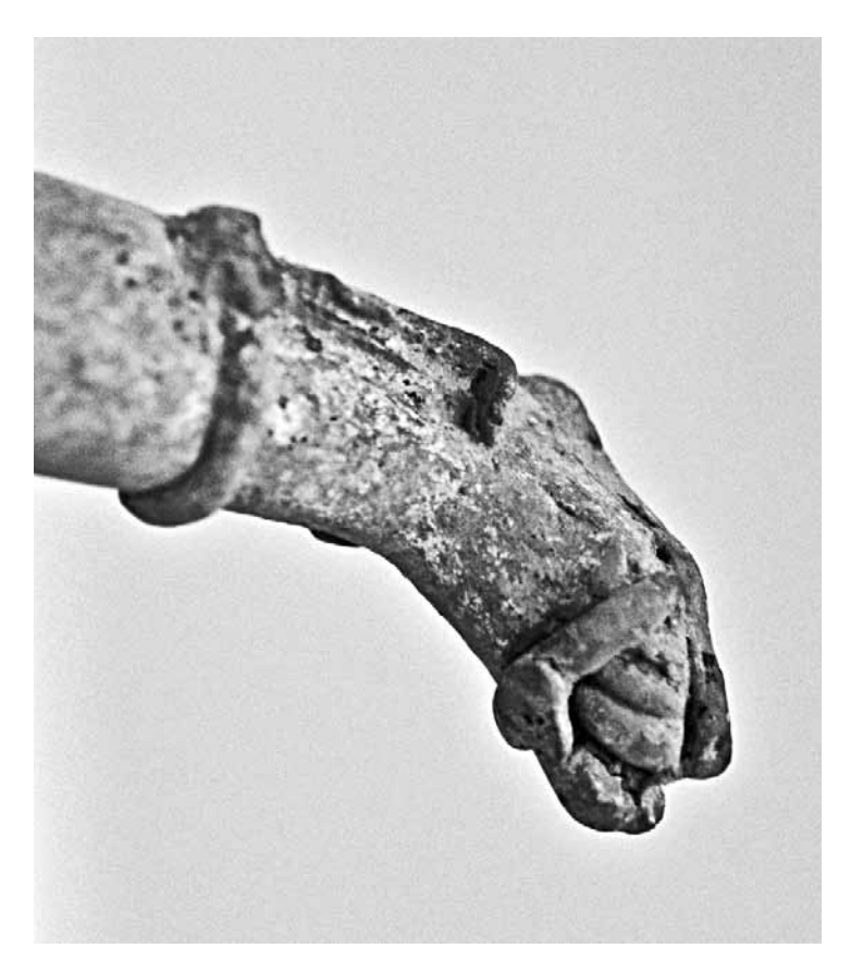
Fig. 6