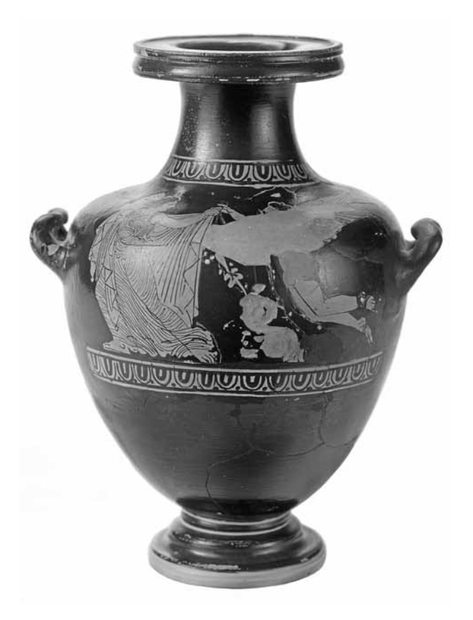
Fig. 1