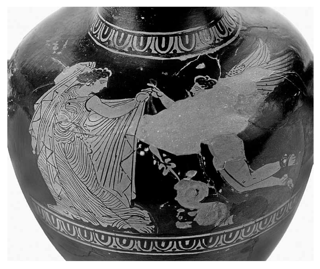
Fig. 2