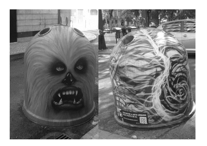
Figure 1 – Interventions in glass recycling structures, «Recycle the Look», GAU.

While this organism evolved, the activities in its range stemmed from the organization of two street art showcases in the aforementioned panels, in which several street artists created, to other initiatives of broader reach. One of these is the initiative «Recicle the look», where glass recycling structures are painted, by anyone interested in participate, so the initiative is not only open to street artists.