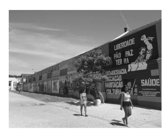
Figure 5: Mural «40 anos, 40 murais», in Alcântara. It can be read «This mural was made with the collaboration of 67 artists and voluntaries, without institutional support. ».