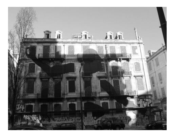
Figure 7 – Intervention in derelict building, project CRONO, by Sam3.

Several initiatives by EBANOCollective have been taking place in Lisbon, but one in particular includes street art, specifically: Passeio Literário da Graça, from 2014. This project included the intervention of several street artists in a set of building facades and walls in the Graça neighborhood, with the common theme the women writers that marked the neighborhood with their presence. These street art actions aimed to make a commentary to the question of the degradation of the buildings in Lisbon, and in this neighborhood in particular, while also taking into consideration the specific cultural aspects that are related with this community.