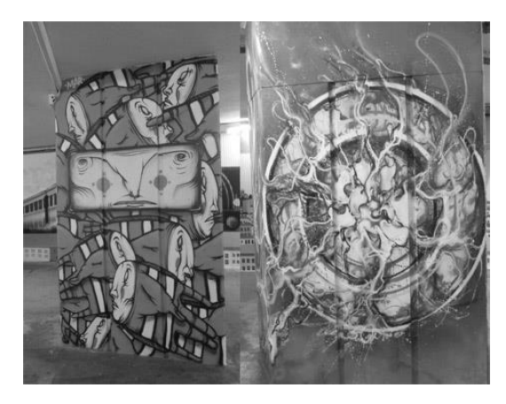
Figure 6 – Interventions in the Alcântara tunnel, MAR and RAM, an initiative by APAURB.