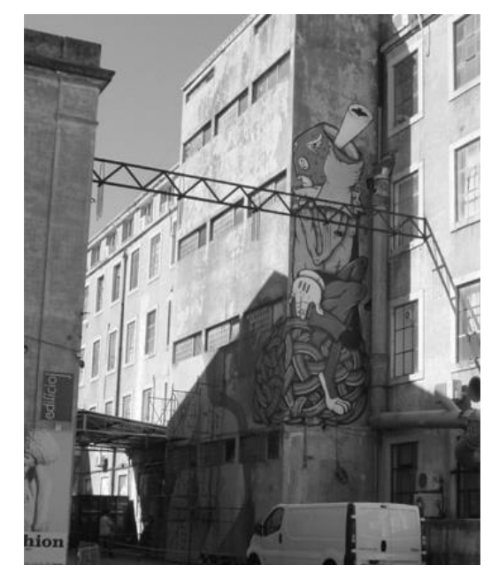
Figure 3 – Intervention by MAR in Lx Factory, Wool on Tour.

The idea to bring street artists to create here appears as a way of creating interplay between the valorization of a space that provides an alternative to real estate and building attention, renewing its uses for the creative industries, and the showcase of street art pieces. Henceforth, Wool on Tour consolidated itself not only as complement to Wool Fest, but also as a way for the organization to keep an activity of production and promotion of street art in the city of Lisbon. The editions of Wool on Tour cover open days, to stimulate contact and communication between public, artists, and the pieces. The walls of Lx Factory have since become a showcase of the work of several artists creating street art- mostly Portuguese but also international.