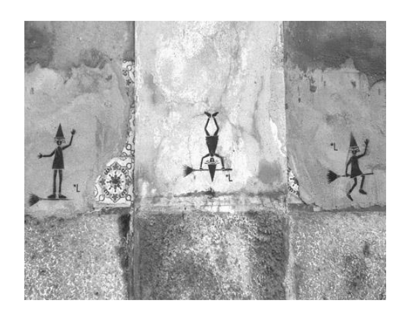
Figure 4 - Stencil figures made by *L.

This was the case with the project of the Alcântara tunnel, as it involved a large number of voluntaries whose work had the purpose to requalify a degraded and aesthetically unpleasant urban structure of daily use. This included known Lisbon street artists, as well as locals who wanted to participate. Their work resulted in the tunnel becoming not only more interesting visually, as it also had the unexpected effect of stimulating the institutional will to regularly maintain the place, in what concerns its cleaning and illumination.