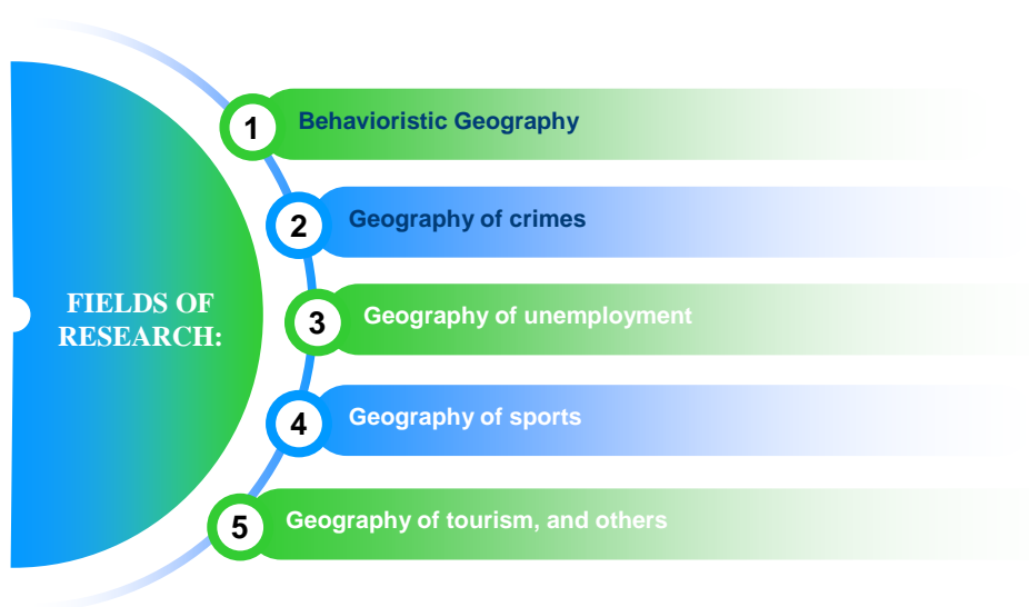
Fig. 3 – Fields of research

In the social sphere the progress is... encouraging, so far.