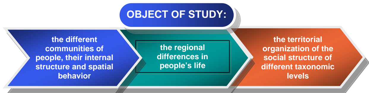
Fig. 2 – Object of Study