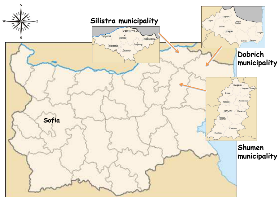
Figure 2. Selected model areas for analysis of the rural territories.

Report examined the rural areas of the municipalities Shumen, Silistra and Dobrich are selected (Figure 2). Each one of them has its distinctions from the others (sea outlet, river outlet or inland territory). Thus conceivably the differences of the examined indicators could be determined in view of their geographic location.