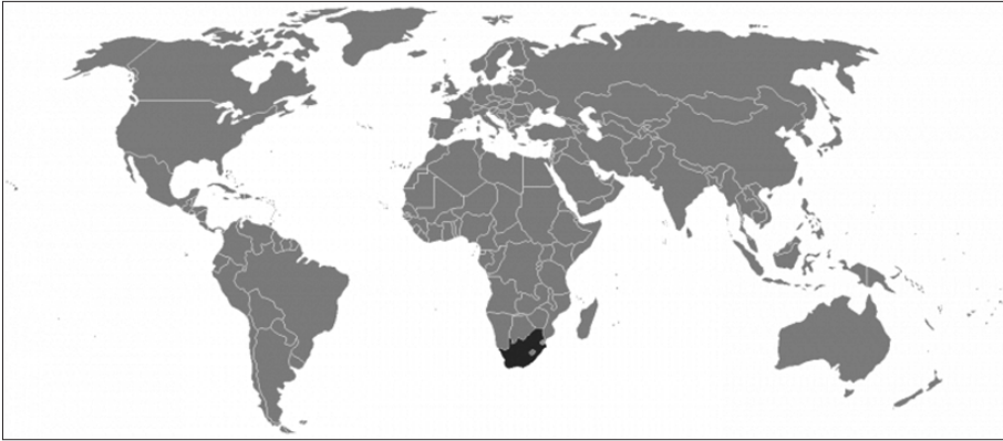
Fig. 1. Study area

One of the most relevant consequences of the 16 th century transoceanic Portuguese travels concerns the acknowledgement and documentation of regions until then unknown to the Europeans. Landscape, fauna and flora were carefully observed and described and for some areas, such as Southern Africa, these records are the first known written documents informing of the regional ecosystems and wildlife.