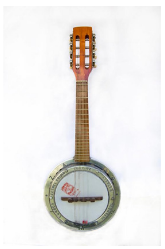
► Figure 2.1.3. - A Turkish mando-çümbüş , purchased from Istanbul in 2006

the use of consumable olive oil cans from the Greeks. Other Greek craftsmen have been experimenting with cigar box guitars, and in the recent years there have been efforts to build cigar box tríchorda , and especially tzourádhes . Finally, some Greek enthusiasts have crafted tríchorda out of coconuts and turtle shells. These modern approaches, though, are based on stories, and pictures of instruments of the 'classic' rebetiko era.