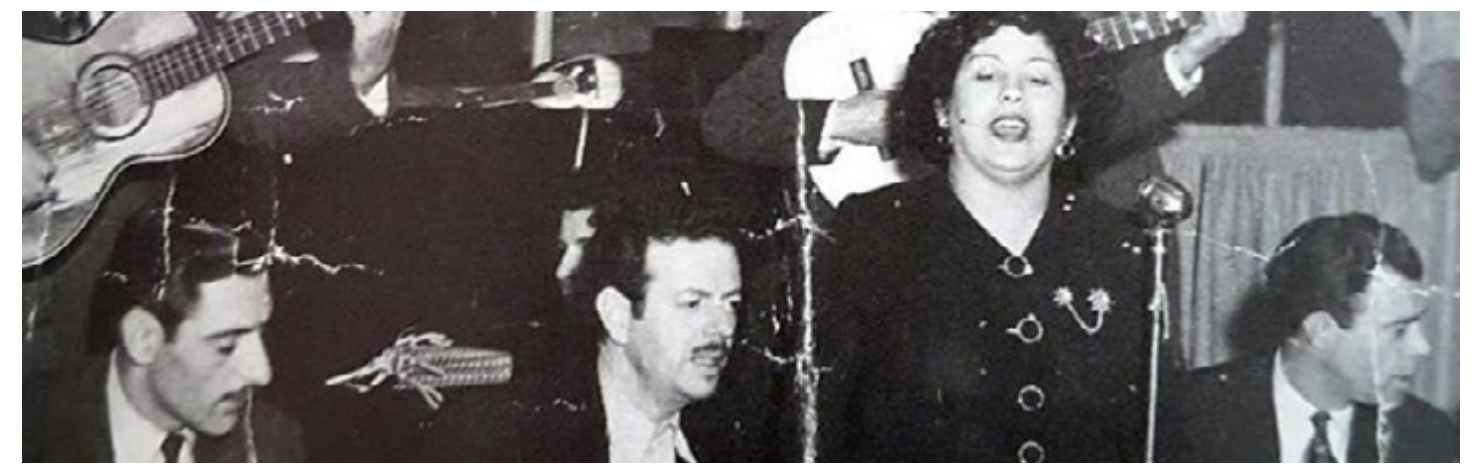
Figure 2.1.2. - Another rare picture of Tsitsanis playing the banjo