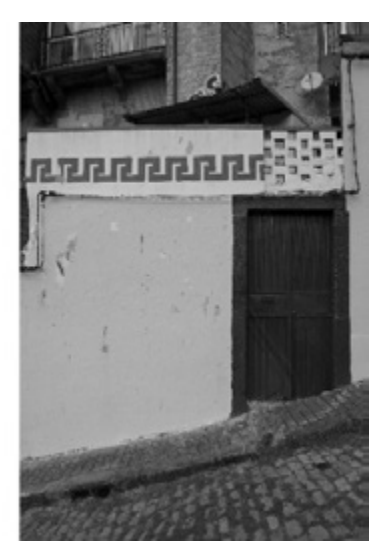
▶ Figure 8.1.4 - Framed gate | Figure 4b - Exterior house decoration | Figure 8.2.5 - Decorative elements on façade