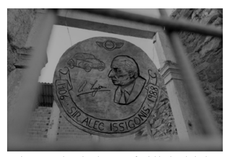
Figure 8.2.1 - The Cultural Memory of Neighborhood: Sir Alec Isigonis Medallion

and derelict structure. The medallion designed by the collective artists in memory of Sir Alec Issigonis, the designer of Mini Cooper, who is thought to have lived in the neighborhood in the past, shows the bond that the collective established with the history and cultural heritage of the neighborhood regarding the period when it was inhabited by non-Muslim minorities. This relief medallion is the artists' first work as a collective.