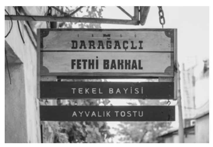
Figure 8.2.5 - Emre Yıldız, Darağaç Signboard Workshop