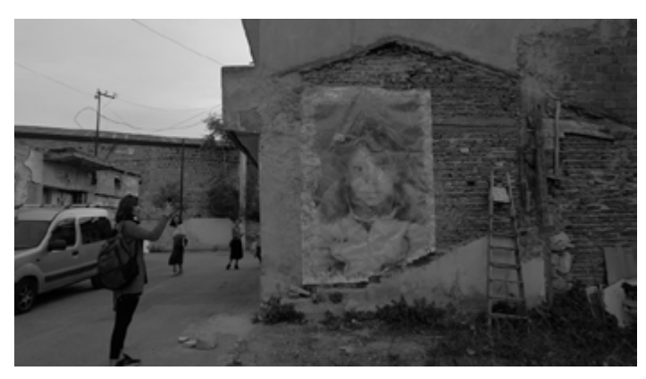
Figure 8.2.4 Mert Çakır, GAP, digital print from found image

changed some of the dynamics in the neighborhood. The fact that sometimes as many as 400 immigrants a day wait in the narrow streets to obtain their IDs has created an unusual movement in the area. At the same time, stories about immigrants have become part of the daily dialogues between the residents of the neighborhood. Photojournalist Mert Çakır (see figure 8.2.4) created large prints of children's passport photos, found images stemming from photo albums left behind by refugees who tried to go to the Greek islands from Çeşme, and hung them on the facade of a house in the neighborhood. Then he photographed this installation for two years, documenting how it was destroyed by the weather. Another guest artist, Leman Sevda Darıcıoğlu, observed the presence of immigrants in the neighborhood, their waiting in the queue and their dialogues with each other and the residents of the neighborhood, leading her to do the performance Waiting II: Darağaç "Who waits for whom, when, and for how long?" in which she tied herself to a tree close to the immigration office and kept watch for 24 hours.