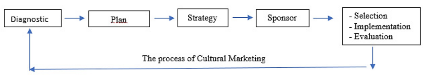
Figure 2 - Cultural Marketing Process

marketing process, but it can also be considered in a more specific way. Companies that collaborate in this sense have not always conducted themselves based on cultural commitment, they simply intend to create circumstances with the public and the media (Reis, 2003).