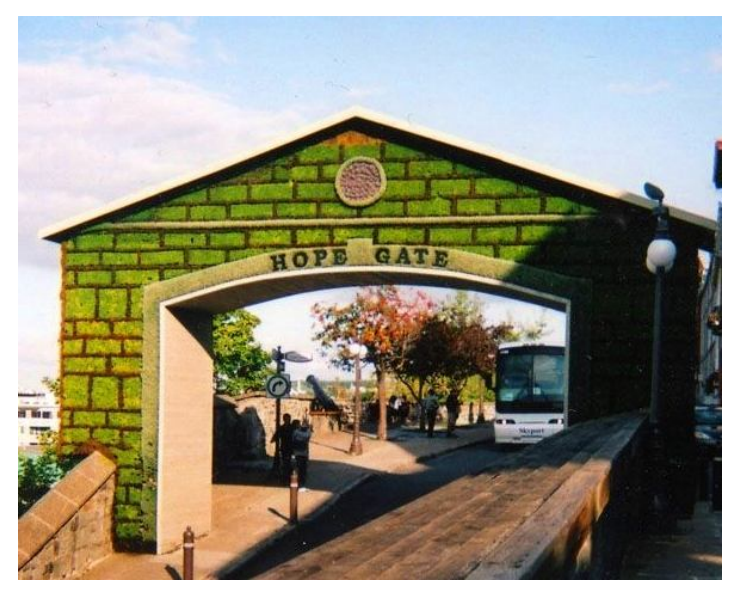
Hope Gate, Quebec City, Canada

The recent economic crisis has forced a discussion of the future of utopianism that had been declared pointless after the Fall of the Berlin Wall: What is the future of late capitalist society? How do we or indeed can we now imagine a post-capitalist, post peak-oil, post-industrial