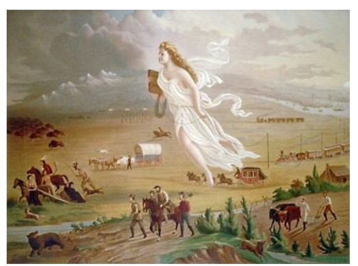
John Gast, American Progress, ca 1872

Yet, the US election results on the 5<sup>th</sup> of November seem to indicate that Utopian hope can fuel political change. Barack Obama's victory and inaugural speeches tap into specifically American utopianism: "If there is anyone out there who still doubts that America is a place where all things are possible; who still wonders if the dream of our founders is alive in our time; who still questions the power of our democracy, tonight is your answer" (Obama 2008). Like Columbia in Gast's allegorical representation of America's manifest destiny, the new US will update "the great experiment of liberty" and "reclaim the American Dream" for all (Weinberg 1935: 45).