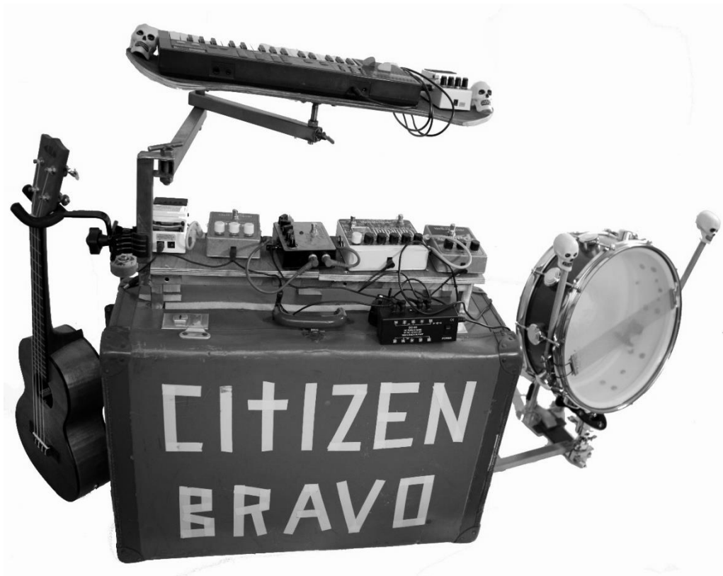
Figure 3 – Citizen Bravo in “performance mode”

Photo by Campbell Mitchell, used with permission.