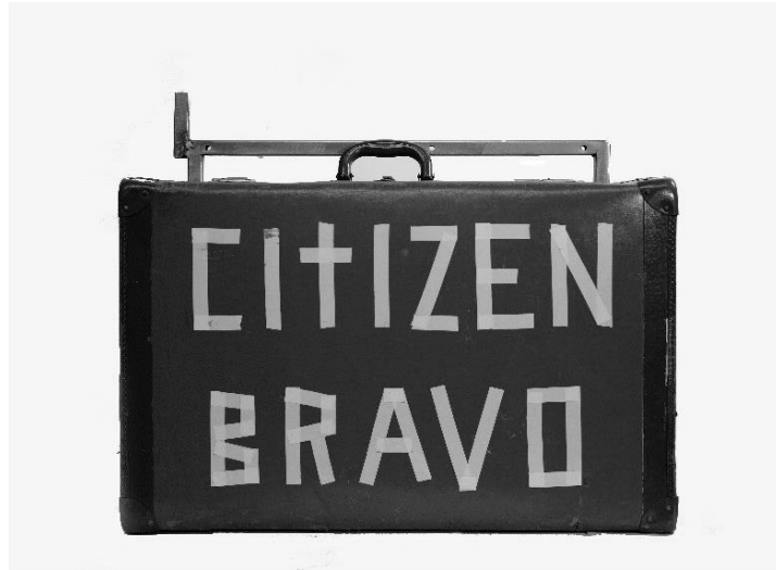
Figure 2 – Citizen Bravo in “transport mode”