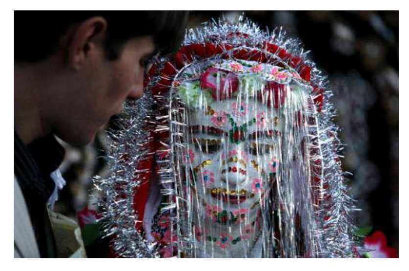
6. "painted" weddings in the Rhodope Mountains