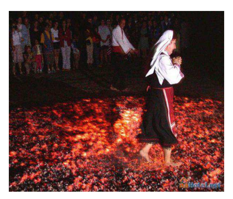
7. Nestinari – walking on the embers.