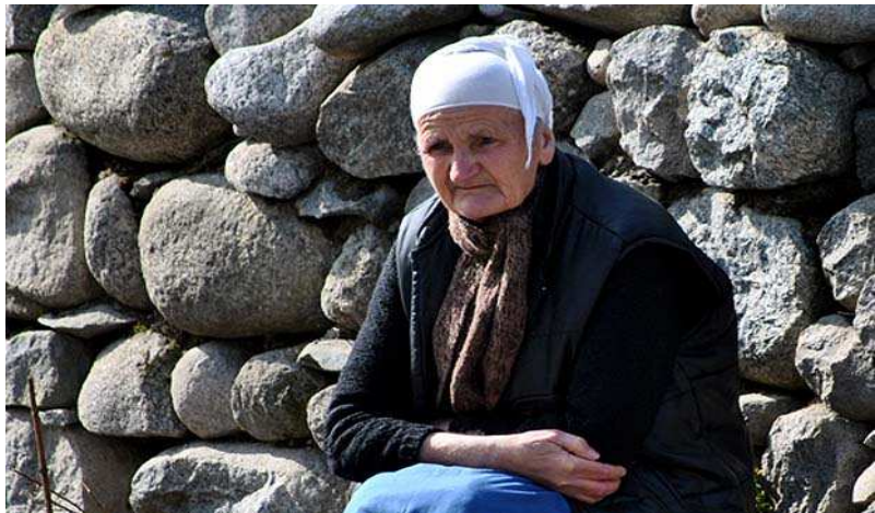
4 and 5. We investigate other material objects: churches, schools, people and etc.