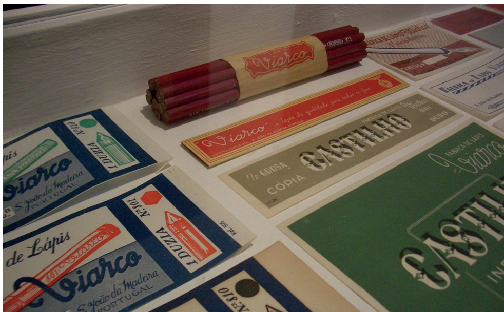
Fig. 3. Detail of Viarco exhibition (2006)