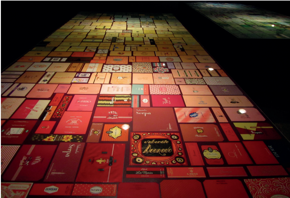
Fig. 7. Detail of the Archive of Confiança Soap and Perfume Factory installation (2013)