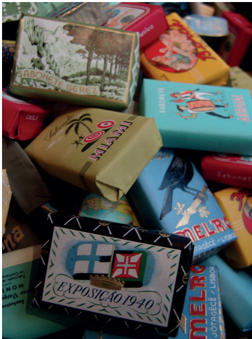
Fig. 4. «Vintage Confiança» product collection for A Vida Portuguesa (2004)

Two projects were developed for the market in collaboration with the project A Vida Portuguesa (The Portuguese Life) 19 and Confiança Soap and Perfume Factory. In the first, original labels from past decades that were deposited in the warehouses of Confiança factory were used to produce soaps wrapped in labels that were decades old. We called this the «Vintage Confiança» soap collection (2004). In the second, we developed facsimile versions of a total of fifteen labels from the first half of the twentieth century, in collaboration with Nuno Zeferino, to create the «Portugueses confiantes» («Trustful Portuguese») collection (2008). With these two commercial projects, I intended to recover and to reactivate images and graphic motifs of the Portuguese industrial past, in an exercise of their maintenance in the present time.