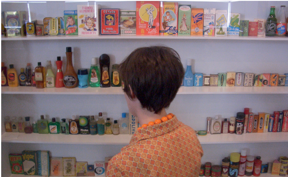
Fig. 2. Undesign exhibition (2003)