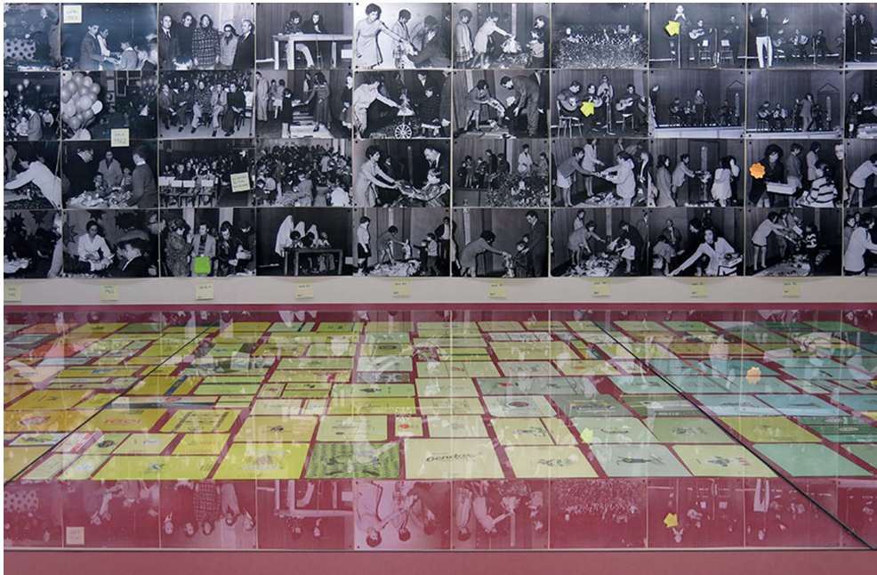
Fig. 8. Detail of The face of Confiança exhibition (2016)