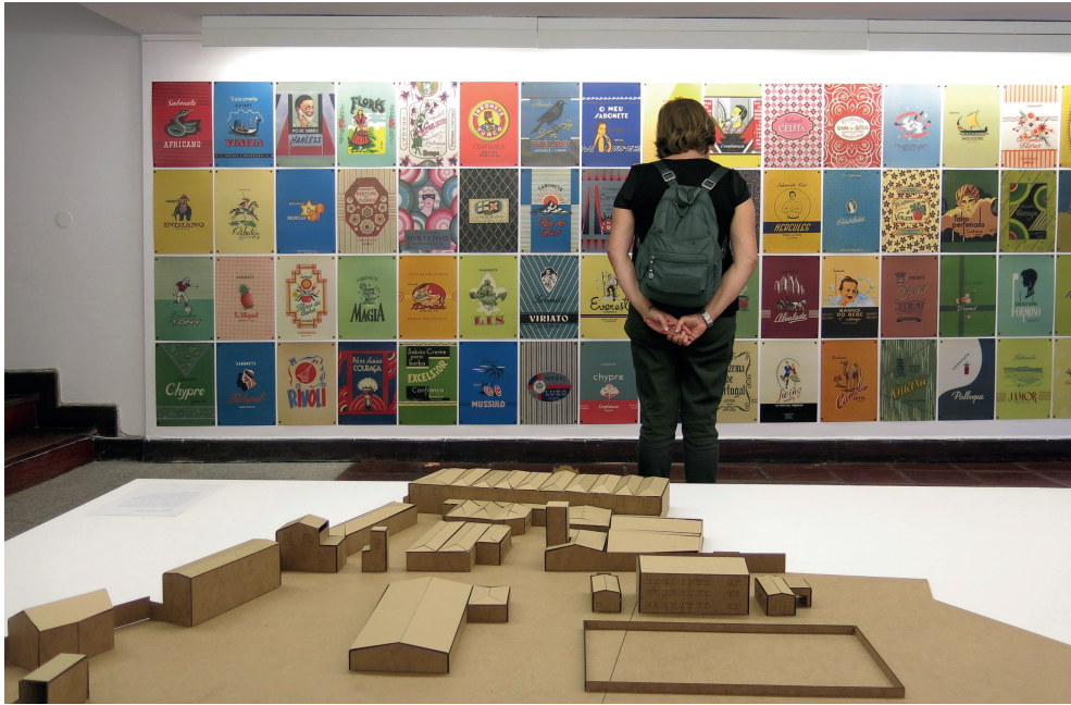
Fig. 11. Detail of A (hi)story of Confiança (Confidence) exhibition (2017)