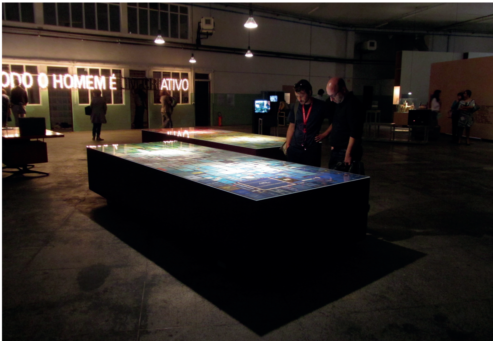
Fig. 6. View of the Archive of Confiança Soap and Perfume Factory installation (2013)

With the «observation» exercise — which resulted in the creation of the installation Archive of Confiança Soap and Perfume Factory — it was my intention to move away