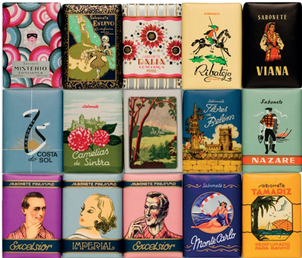
Fig. 5. «Portugueses confiantes» product collection for A Vida Portuguesa (2008)