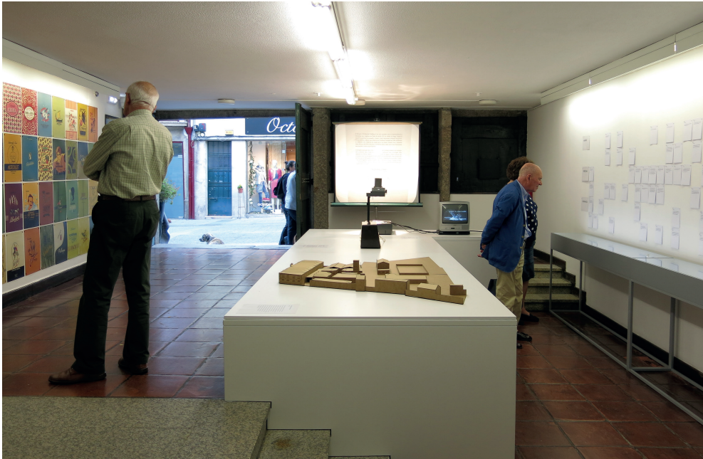
Fig. 12. View of A (hi)story of Confiança (Confidence) exhibition (2017)