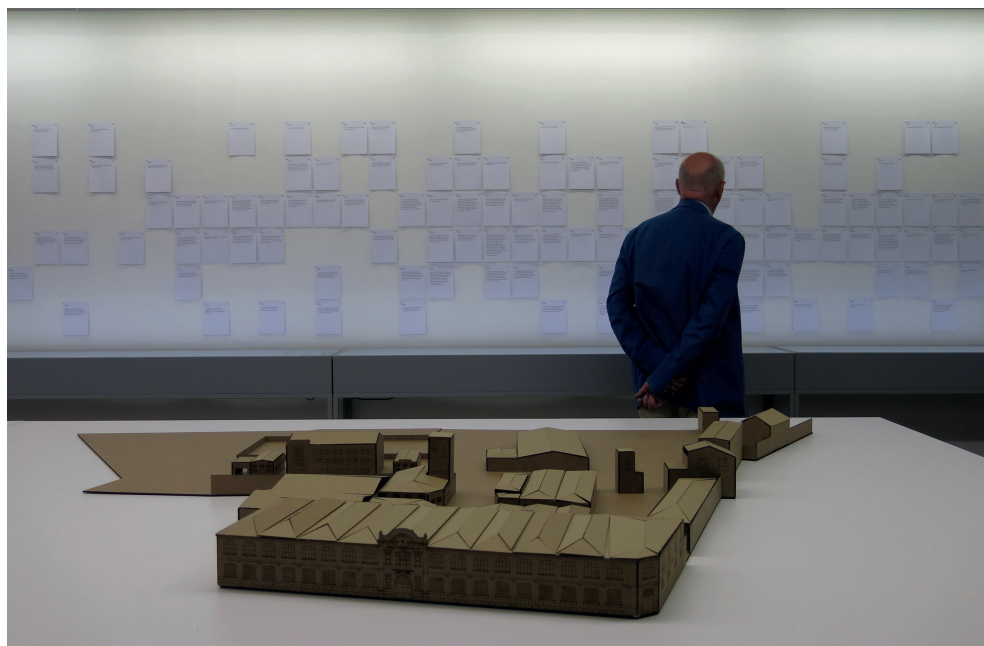
Fig. 10. Detail of A (hi)story of Confiança (Confidence) exhibition (2017)