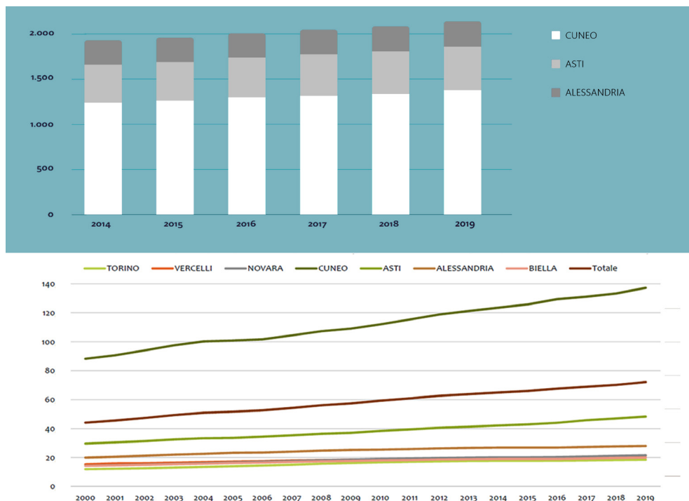
Fig. 3. On the top: average values of vineyards by UNESCO provincial altitude zone (Cuneo, Asti, Alessandria); on the bottom: Average values of vineyards by UNESCO regional altitude zone (Cuneo, Asti, Alessandria, Torino, Biella Vercelli)

The nomination as a UNESCO heritage area also continues to have a positive influence on wine and food tourism from abroad in the Langa areas and the vineyard lands (especially for the production of Barolo and, with increased interest, Barbaresco) maintain exceptionally high prices that continue to increase. According to CREA's surveys, the most highly quoted vineyards are still those of Barolo DOCG (Denominazione di Origine Controllata e Garantita), with a range that can go from 200,000 euros to 1.5 million euros, ahead of those of Brunello di Montalcino, which produces an exceptional Tuscany wine, which oscillates between 250,000 and 700,000 euros per hectare. Barbaresco also ranks high overall, with quotations of around 600,000 euros.