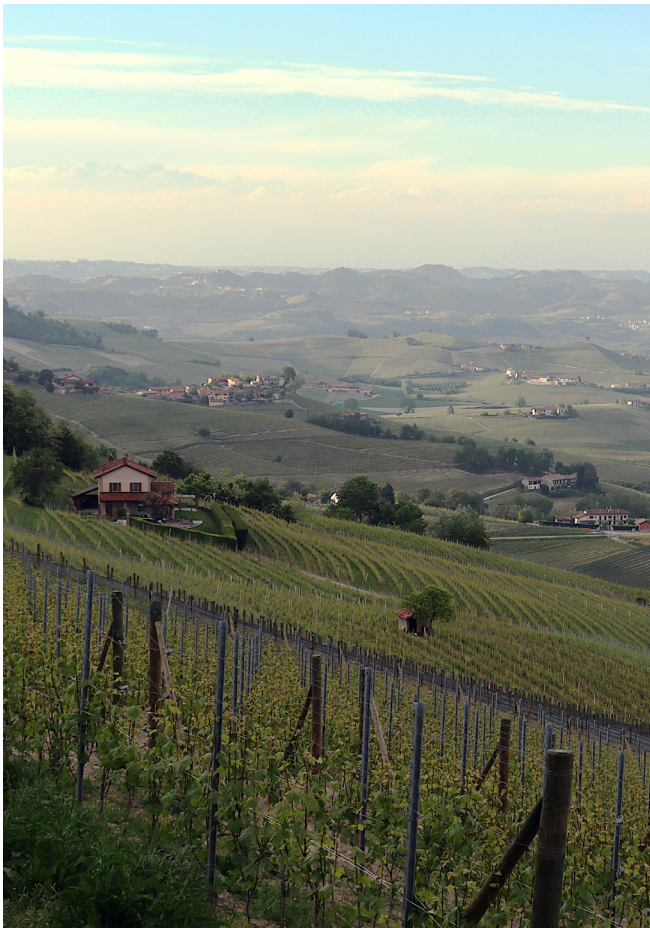
Fig. 1. Monocultural landscape of Langhe

of the Langhe and three in the Monferrato. The landscape components were selected to exemplify the significant places of winemaking from cultivation to production, from conservation to distribution, retracing and emphasizing all the elements that distinguished them in the production process, the historic settlement and architectures, road networks, etc. Each area is linked to specific a wine grape variety, a terroir , a winemaking technique, or significant historical places, ranging from castles to artefacts of a vernacular nature, for the history and development of wine growing and winemaking on a national and international scale. The structure of the native vineyards is distinctive: they are planted around the hilltops with moderate or gentle slopes characterised by the absence of walls and terrain, resulting in a systematic arrangement of rows running along the oblique curves of the hillside. All these elements have created a district in a unitary and complete geographical reality: it has made the cultural heritage capable of fortifying and shaping the identity of the UNESCO landscape.