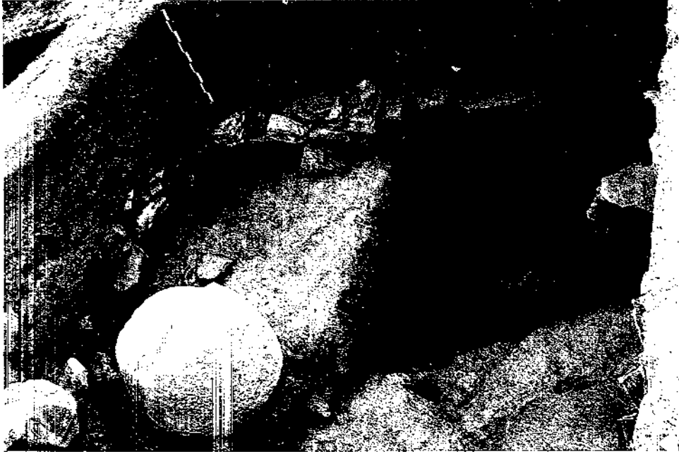
Rg. 16.1 - Estrutura de lagar vinario com felum .